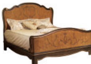
Villa D'Este King Bed