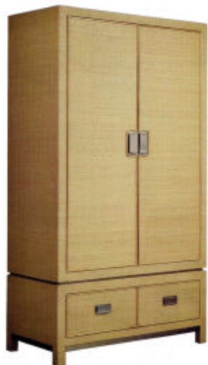
East Winds Armoire in Manoa