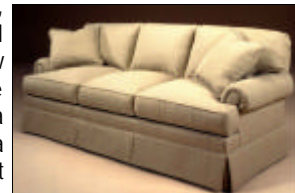
Personal Choice II Sofa

Personal Choice II is the "smalling down" of the original program that lets you design your own sofa by selecting your arm, base and back pillow style to create a unique sofa that can be a 66" loveseat or a 102" ex-