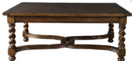
Barley twist cocktail table

Another special feature at this market was the Barley Twist occasional collection with exciting new design enhancements. An ensemble of beautiful occasional pieces from cocktail and console tables to a twisted drop-leaf triangle table created with the unique touches and quality you've come to expect from Lorts.