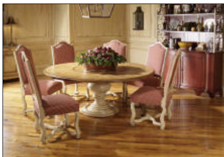
New Town & Country

Regent is a fresh, stylish, 21st century interpretation of the homey, accessible, "dressed-down" neoclassic furniture that swept post-Napoleonic Europe. Crafted from European Birch and Yew veneers, this bedroom, dining room and occasional collection has a light, clean, almost modern feel. Yet its elements—overhanging tops, diamond motifs, reeded pilasters, the rare ebonized accent—are undeniably classic