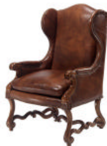
Portuguese Wing Chair