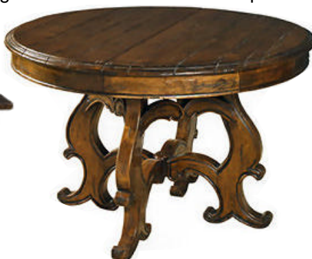
Carved base Dining Table