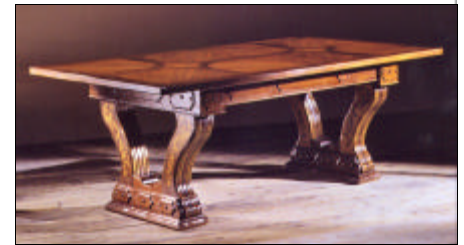
Tavolo "Certosa" - (94.5" x 47.25")