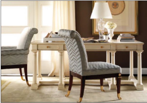
Alexa Hampton 's Console/Writing Desk

Alexa Hampton's new furniture line for Hickory Chair reveals the hand of a visionary designer who always considers the way people actually live. Her more than 40 thoughtful and divergent pieces range from a grandly-scaled ottoman and TV cabinet to a demure dressing table and tufted bed. Hampton hopes to encourage people to live with furnishings from various eras and collections to achieve a more individual expression of themselves and their interests.