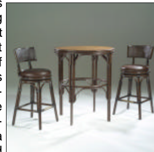
Hi-low Bistro Table

HOUSE & GARDEN Special Designer Survey - "When You're Feathering your Nest, you want it to be the Tops. House & Garden asked the country's leading Interior Designers to rate the places they go for everything. Here's what they told us:" RANKED WITHIN THE TOP TEN