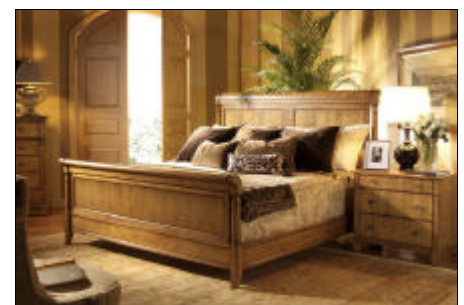
Regent Panel Bed Part of Century Destinations