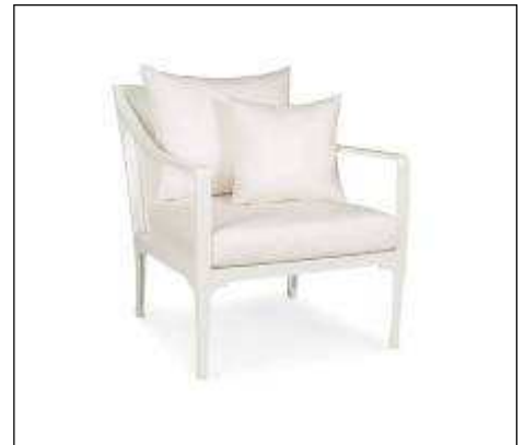
D26-12 Lounge Chair

A new indoor/outdoor furniture grouping from the Richard Frinier Collection for Century captures the mood of this fashionable locale. Riviera is a contemporary interpretation of modern French styling enhanced with reduced detailing.