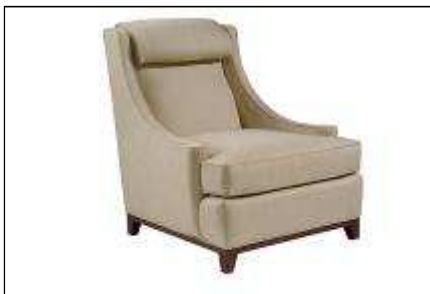
Harden's New Generations Collection 6429 Arm Chair by designer Tony Roberts

Harden has a new Perfect Fit Wall System available in three different heights, with a maximum of 108". The "Perfect Fit Wall System" can be customized to fit any space. Made with beautiful cherry wood, crown moldings, elegant raised panel doors, and glass or wood shelves.