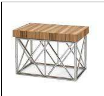
84-605 Milan X Base table

Encompassing bedroom, dining room, and occasional pieces, the collection pays homage to the minimalist design themes fashionable in western European cities. Signature pieces include dining and cocktail tables with debarked raw slab tops combined with lustrous stainless steel bases. (Matte bronze-finished metal bases are also available for those who prefer a quieter contrast of materials.) But Milan's geometric accent tables, crafted in veneers of fiery satin walnut, are no less stunning.