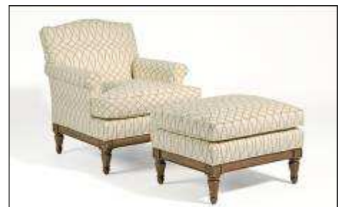
Pearson 872 lounge & Ottoman

Pearson also introduced over 25 new upholstery items. One example of a classic traditional piece is this, Louis XVI Lounge No. 872, a smaller scale lounge with an exposed solid maple carved base. The lounge also has a tight boxed back with rolled arms and a boxed T cushion.