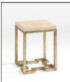
Pearson 9651 Bunching table

bles to grand cocktail tables. With fine exotic veneers, hand gilding, precision metal work and jewel like hardware, each piece makes a one-of-a-kind statement, like the 9651 Bunching Table. This great new table has an ivory faux leather top and gilded iron legs with a fretwork base.