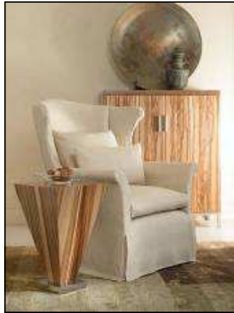
11-719 Milan Natural Mendocino Wing

Once upon a time, contemporary meant cold. Hard. Even bleak. Contemporary design was all about black leather, chilly steel, molded plastic, stark lines. In the battle between comfort and aesthetic purity, comfort lost out every time. But something interesting happened on the way to eco-enlightenment. In the soft, leaf filtered light of the green movement, contemporary warmed up. "Today's contemporary design has a kinder, gentler soul," says Edward M. Tashjian, VP of Marketing for Century Furniture. "The basic look hasn't changed; it's still clean, crisp, and streamlined. But Mother Nature has emerged as the ultimate designer. What was once sterile has become earthy and organic."