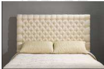
Harden's New custom Upholstered bed program

HARDEN October 2008 market introductions