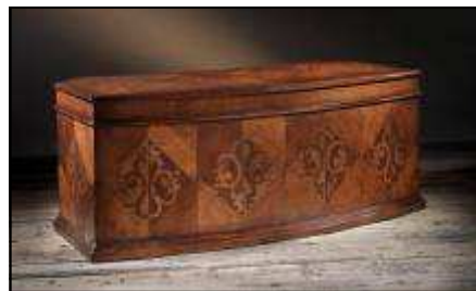
Artitalia VA SCRIVANIA

renowned limited addition "Giorgio" Credenza with the a gracefully curved wall shelving unit. This combination creates the unique VA1960. (right)