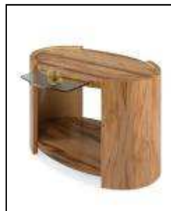
84-631 Milan Oval Nightstand

The Crescent Base Table, for instance, has a satin walnut veneer framed antique mirrored top on a stainless steel base fashioned into a stylized crescent. The same theme of earthy materials mixed with cool ones appears in other forms: an inverted pyramid on a reflective square, an oval table with a glass pull-out tray, a solid rectangle on an open framed X-sided metal base. "The frisson between raw natural materials