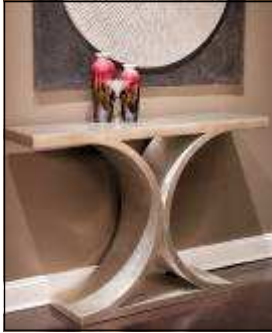
Tower Console Table