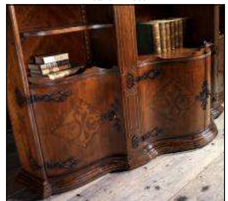
Artitalia VA1960 front detail