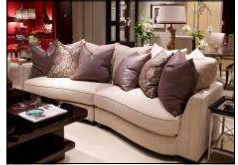
Larry Laslo Conversation Sofa

Ferguson Copeland has introduced a new contemporary line of upholstery and case-goods. The tower console table is a great example of this new look. With it's unique silver finish it gives a hallway or entryway