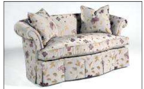
Pearson 2264-10 Box Pleated Sofa

Pearson introduced 90 plus new fabrics and leathers; such as, linens, velvets and heavy textural weaves with 30% of the new fabrics made of natural fibers. One of many fabrics is this lavender heavy slubbed linen, embroidered in celadon, plum and butter, creating a